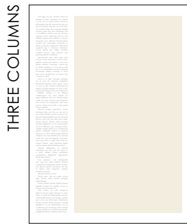
W 7 1/4" x H 13 3/8"