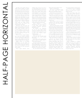
W 9 3/4" x H 6 5/8"