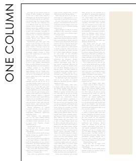
W 2 1/4" x H 13 3/8"