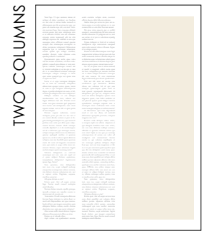
W 4 3/4" x H 13 3/8"