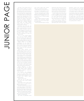
W 7 1/4" x H 10"