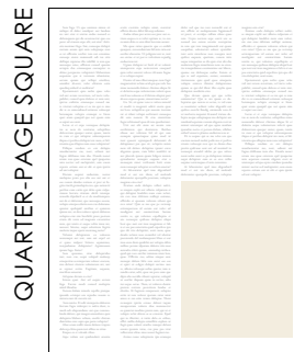
W 4 3/4" x H 6 5/8"